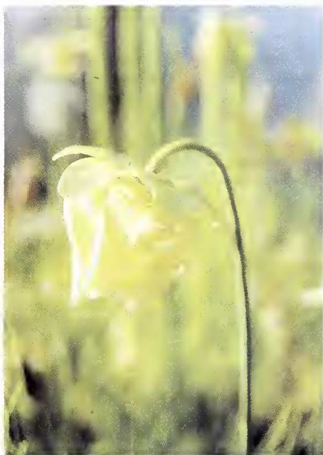
Figure 2. Flower of anthocyanin free form of S. psittacina .